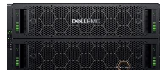
ME5084 84 drive / 5U

Optional ME5 expansion enclosures let you scale up to 336 drives or 8PB 1 . PowerVault ME412 and ME424 expansion enclosures can only be used with either ME5012 or ME5024 base arrays. The ME484 dense expansion enclosure is supported behind any of the ME5 base arrays. A variety of SSD, 10K and NLSAS drives (including FIPS SEDs) are available.