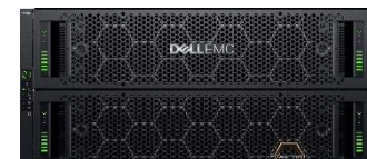
ME484 Expansion Enclosure 84 drive / 5U